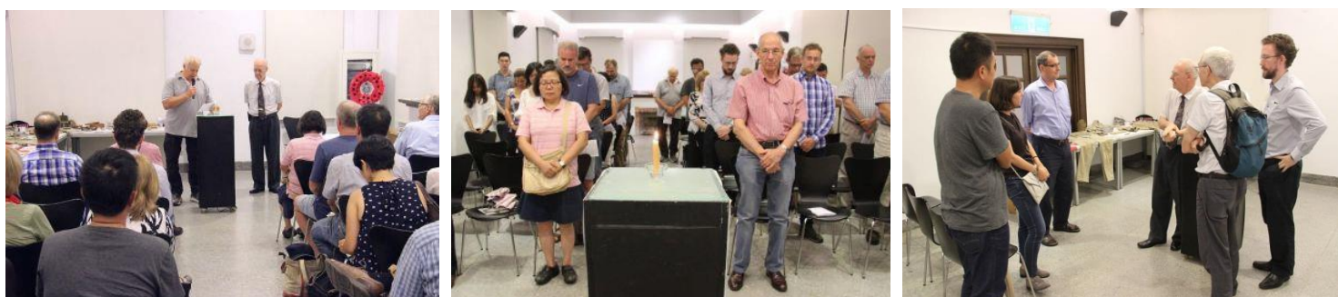
Reading the FEPOW Pledge