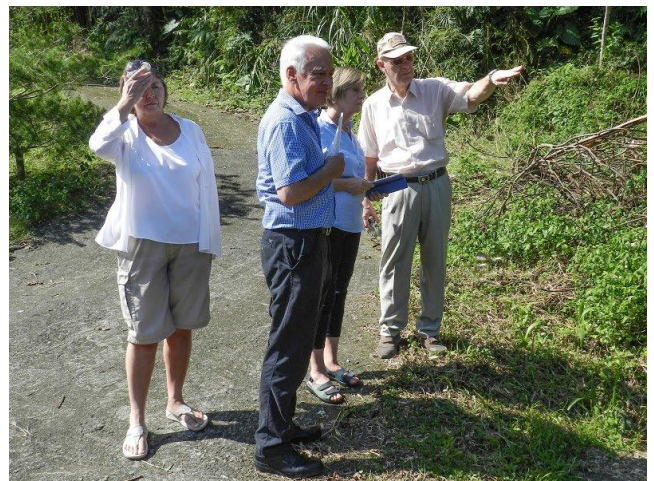
Exploring the area inside the Kukutsu Camp.

On Saturday morning we took a trip to Hsintien to see the old street where the POWs loaded up with supplies for the camp and the suspension bridge across the river where they started their arduous journey up into the mountains beyond. We explored the route the POWs took to the camp and once there a short memorial service was held, followed by a walk around the camp area. Saturday evening our guests were treated to a wonderful dinner put on by our co-host, the New Zealand Commerce and Industry Office in Taipei.