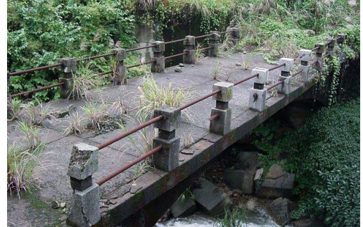
Old Bridge to the Kinkaseki POW Camp

They wanted to see and learn more about the mine and what the POWs experienced there so they decided to return again - by taxi, the next day. They visited the mining museum which houses the Society's POW exhibit, and paid to go down the nearby # 5 mine tunnel - which they would not have had to do if they were on our tour. They would not likely have gotten full value from the museum and mine tunnel exhibits either, without someone to explain the workings and how the POWs survived their ordeal from day to day. In all they spent two days and several expensive taxi rides to first find the camp and then return again on the second day to explore Jinguashi more fully. With our tour we do it all in one day - smoothly, conveniently and in proper order, leaving other days free for more camp visits or further sightseeing, shopping etc.