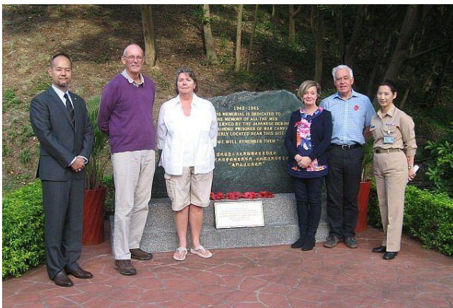
With MND Admin Staff at the Taihoku # 6 Memorial.

Friday, our guests enjoyed some local sightseeing - a Chinese temple, the National History Museum for a guided tour through 5000 years of Chinese history (in about 1 1/4 hours), and then the sumptuous buffet lunch at the famous Grand Hotel before proceeding to the National War Memorial to see the changing of the guard. Following this we made our way to Taihoku Camp #6 for a visit and memorial service.