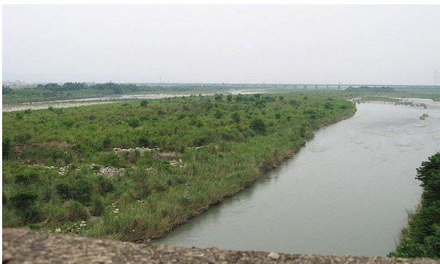
From the bridge, the view of the area where the POWs excavated the flood diversion channel.

View along the top of the river wall that ran next to the camp. The POWs called this the "River Wall Camp".