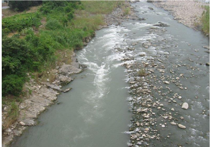
The former flood diversion channel up-river is still partially filled in with sediment.