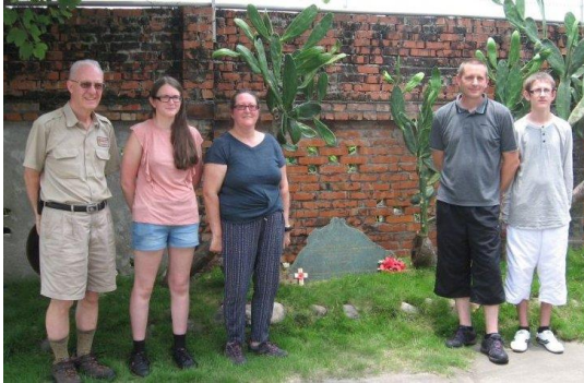
At the Taichu POW Camp Memorial.