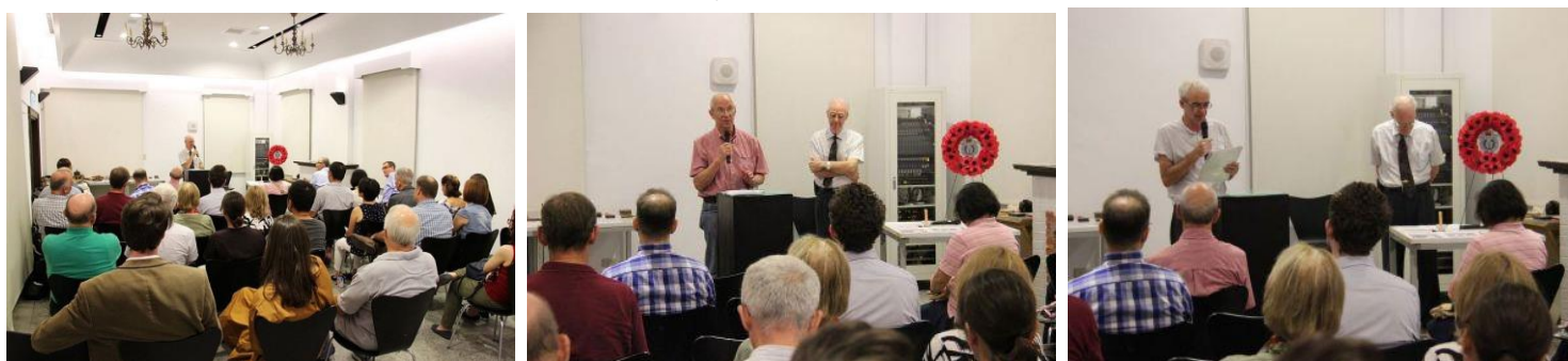
The audience and the memorial service with the lighting of the FEPOW candle in remembrance.