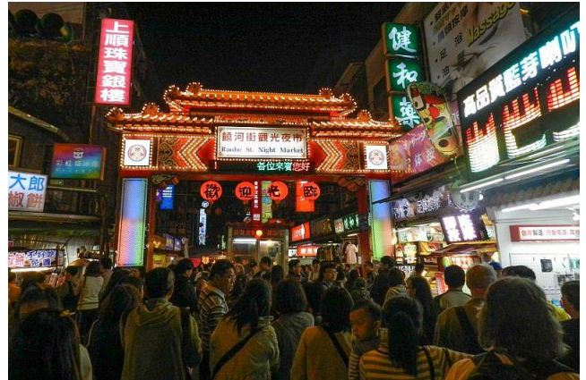
The colourful, crowded night market was enjoyed by all.