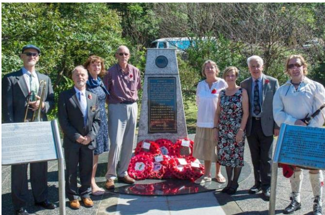
The families with the musicians after the service.