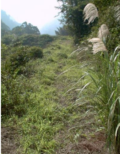
The 'real' trail to Kukutsu Camp

For the POW family members who visit, we can often introduce them to some of the local folk who still remember the POWs.